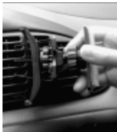
Fig.1 Rotate and insert to attach.

The Vent Clip provides a mechanism for easily mounting and viewing the PDA in your vehicle.