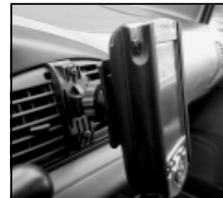
Fig.4 Installation finished.