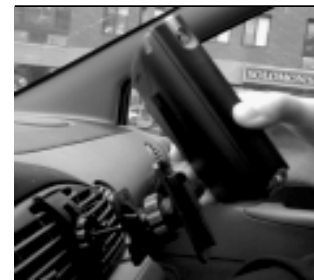
Fig.3 Slide in, adjust viewing angle.